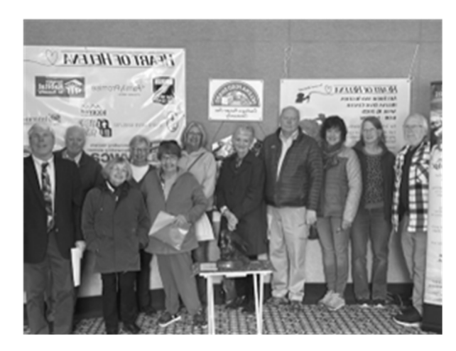
Be on the lookout for our advertising for the event!

We are also looking for volunteers - you can go to this website to sign up or call Roger Reynolds, our bookkeeper, at the church. Click here Helena Art Show to signup online.