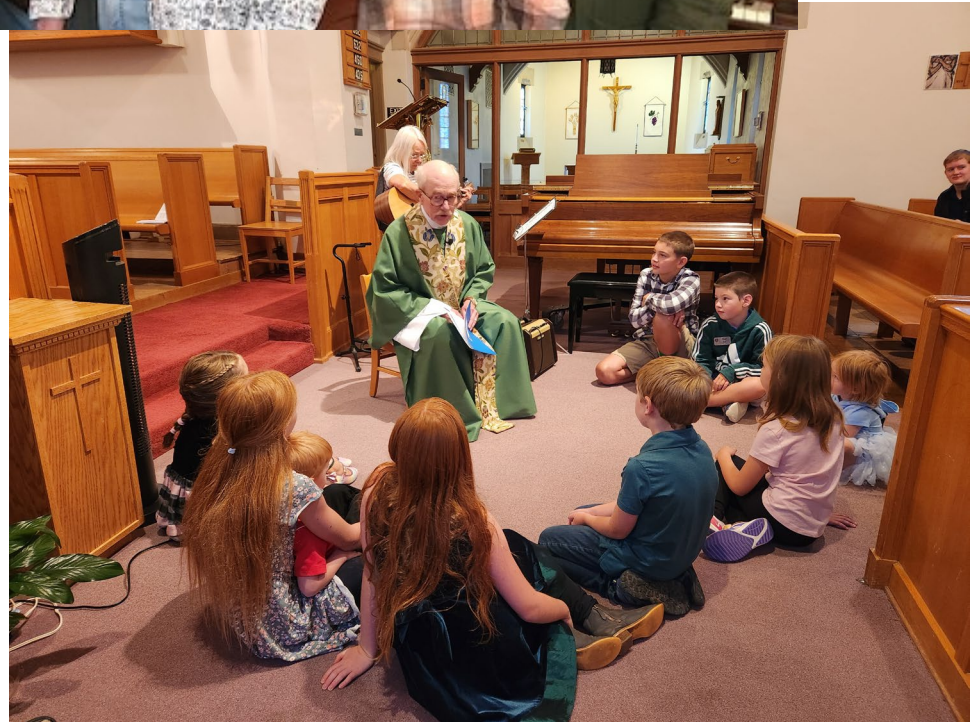
Pictured: (Top) A member’s Discernment Committee. (Bottom left) Togendowagan Society community meal. (Bottom right) Children’s sermon.